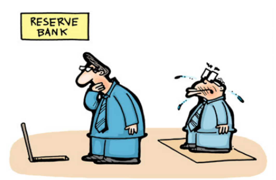
The interest rate rise lever.